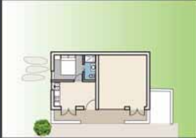
staff house & warehouse