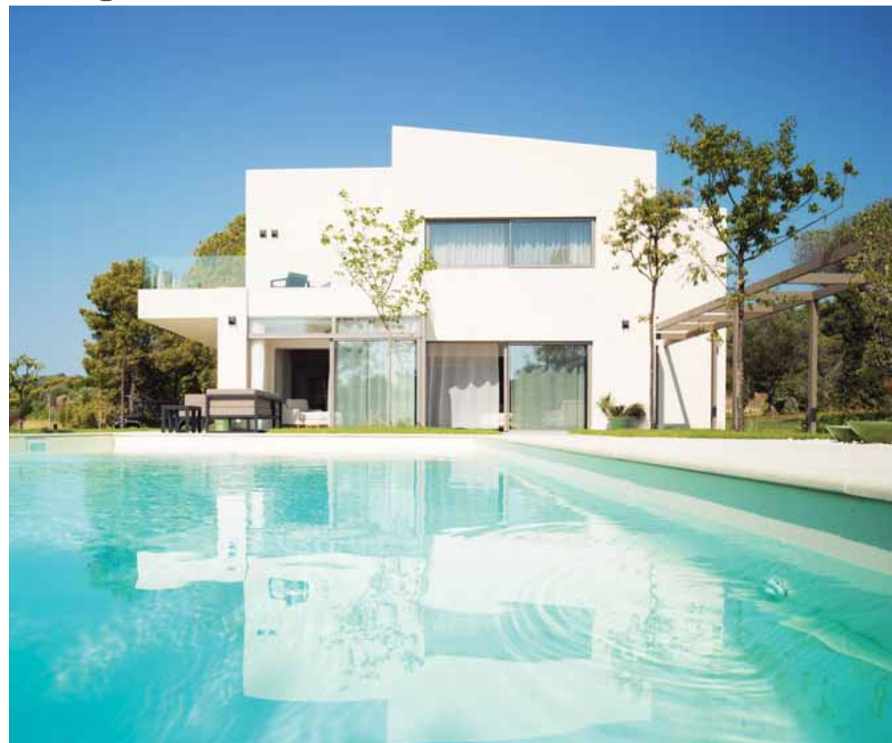
Diaporos Island | Greece