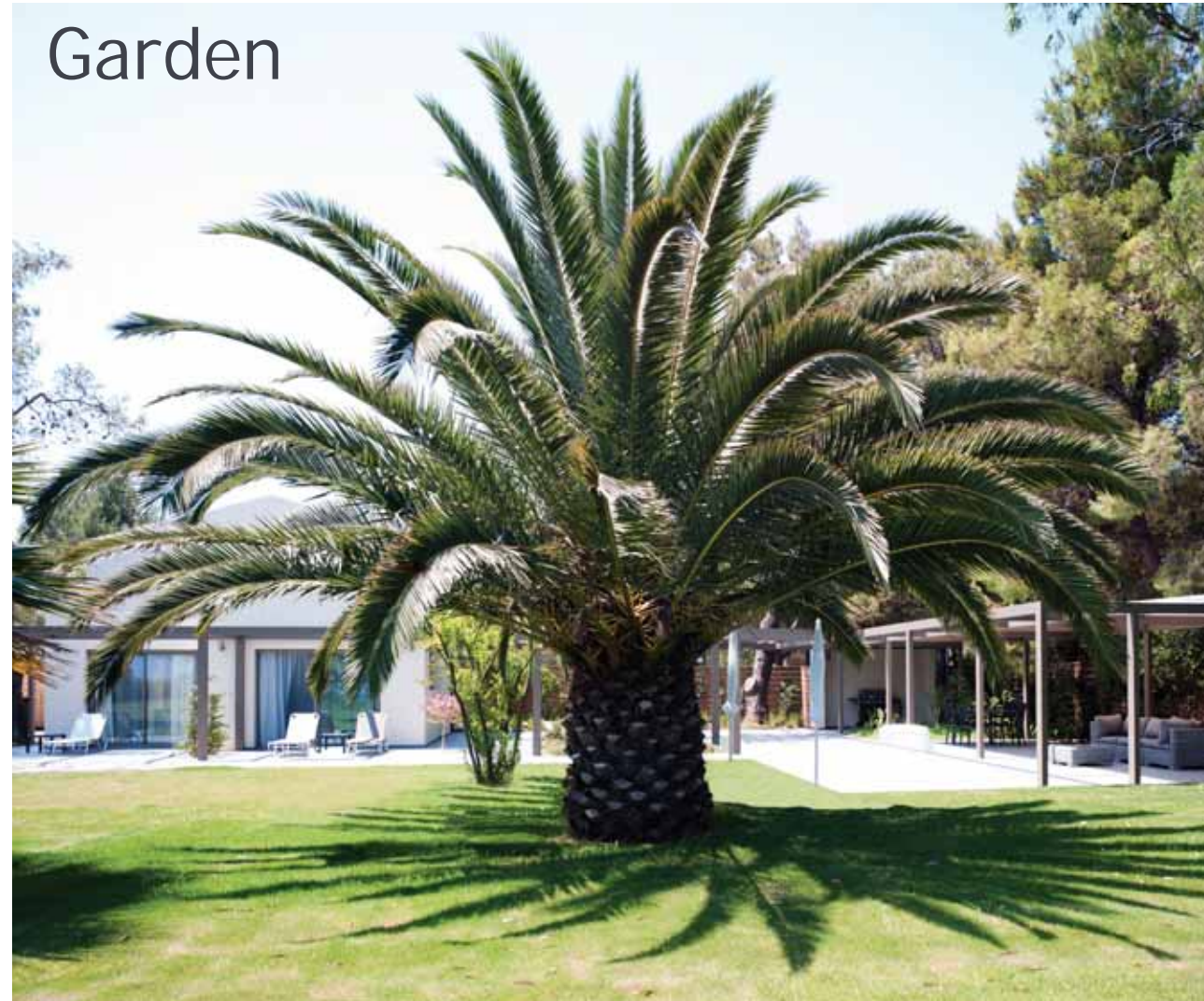
Vourvourou | Greece