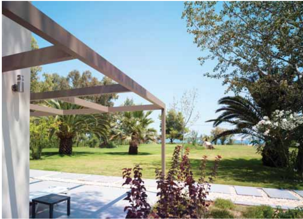
Colonnades lead to the fully-equipped barbecue area, where you can enjoy your meal while taking pleasure in the well tended surroundings.